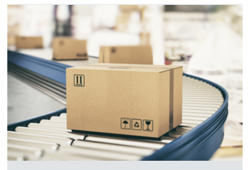
Power supply of systems technology